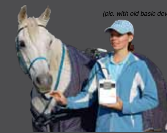
(pic. with old basic device)

The magnetic field blanket raises the well-being of the horse and provides faster recovery during and after the competition. No doping!